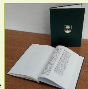
Image of a bound Family History Report

Your enquiry may also be posted to us at: Family History Research Unit, North Mayo Heritage Centre, Enniscoe, Castlehill, Ballina, Co. Mayo F26 FR94